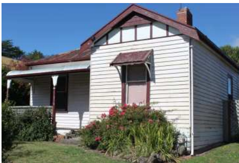
75 Piper Street—next to Museum buildings

Landscaping will be undertaken to connect 75 Piper St to the Museum and to facilitate better disabled access to the Museum precinct.