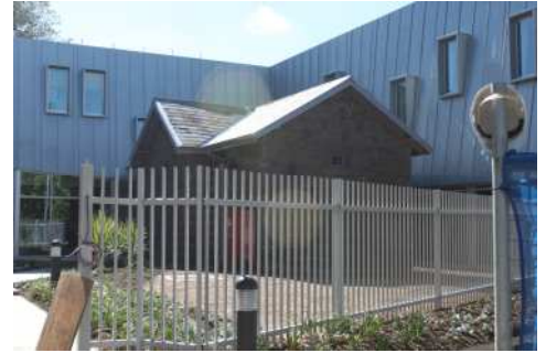
The historic lock-up stays at the new Station

If all goes to plan, police officers currently stationed in the temporary station in Beauchamp St, will move into the new Station in Jennings St on May 10.