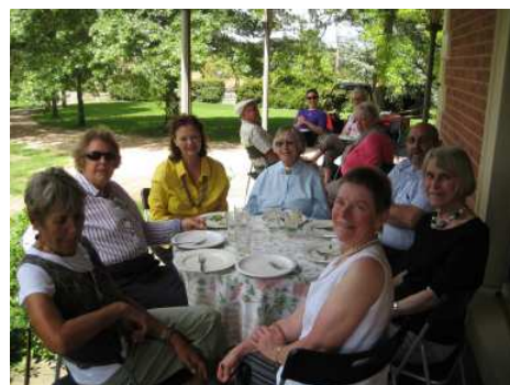
Not so desperate Members of ADFAS enjoy an al fresco lunch after a visit to the world renowned Flynn Silver Studio and Workshop