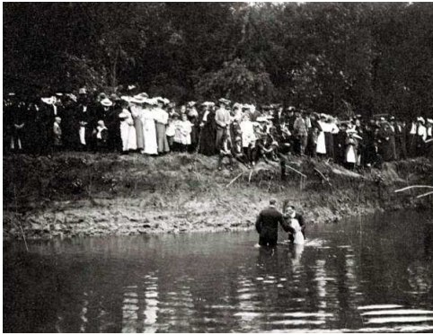
Baptism in the Campaspe 1860

In October 1860 the rite of Believers Baptism was administered for the first time in Kyneton in the flood swollen Campaspe River, just below the Gardens. A week later the Kyneton Baptist Church was constituted and the following week plans were set in motion to build a chapel.