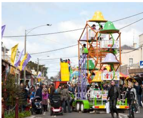
Crowds enjoying the Fair following the Parade