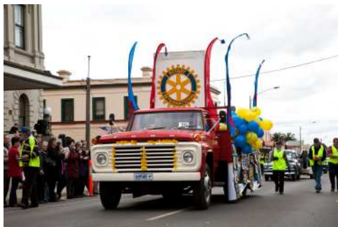
Rotary Float Prize winning entry on theme 'Kyneton—Blooming with Pride'

Thousands of locals and visitors flocked to this year's 11 day Kyneton Daffodil and Arts Festival. The downpour and flooding reduced visitors to events and open gardens in the opening days of the Festival with even some officials unable to get through because of flooding but there was solid attendance from local residents.