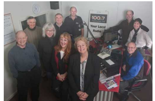
The Community Radio 100.7FM Radio Team