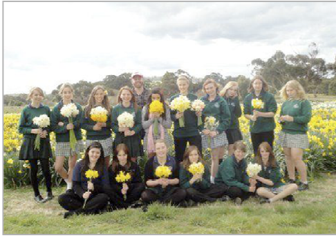
Students collect daffodils for Rotary's charity effort

Kyneton Secondary College and its students are strengthening links with the community.