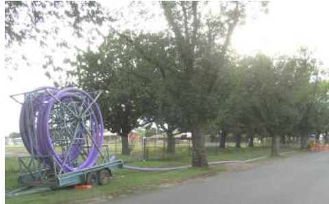
Rollout of purple recycled pipe Beauchamp St

Works to connect recreation facilities in Kyneton to recycled water supplies should be completed by the end of March.