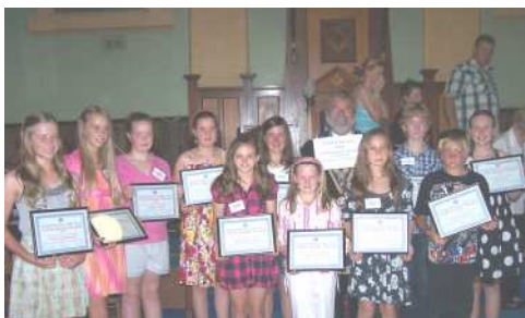
Bursary recipients at Zetland Lodge

The Kyneton Masonic Lodge presented $200 bursaries to 4 Grade six students from the 2 Kyneton primary schools entering Secondary College and other donations of $200 each to the 430 Air Cadets Squadron, Kyneton Municipal Band, the Macedon Children's Choir, and the 4/19 th Light Horse Regiment Association.