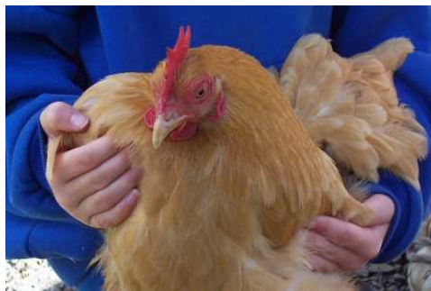
Even the chooks are handsome at the Tylden Primary School Fair