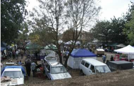
A busy Easter Farmers' Market

It seemed the biggest Easter Saturday in Kyneton since the Calder bypass.