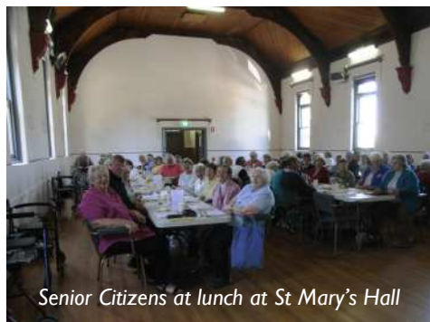
Senior Citizens at lunch at St Mary's Hall

Every Thursday at midday 50 or more of the 150 members of the Kyneton Senior Citizens Club turn out at St Mary's Hall in Hutton St for a great meal (provided for $8 by the Club) and a huge variety of activities and entertainment.