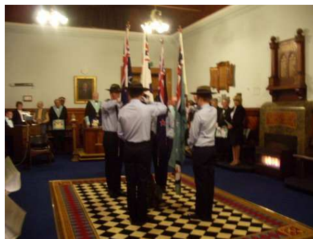
Cadets at Vacant Chair Ceremony