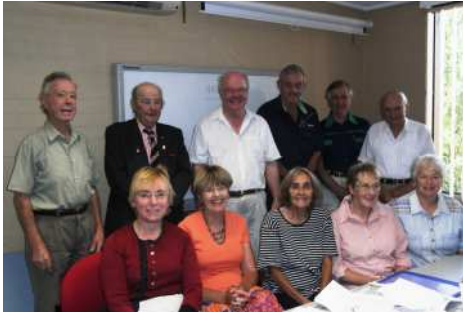
The Kyneton Connections Team

This edition marks the third anniversary of Kyneton Connect . The first Kyneton Connect came out on Thursday April 20 2006 and it has been published on the third Thursday of each even month ever since. The aim was, and remains, to inform and involve Kyneton people in the activities of their community to give local groups the certainty of coverage of their activities and achievements. The newsletter is unashamedly parochial – it promotes the interests and wellbeing of the people and businesses of the Kyneton District.