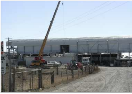
Kyneton Crane at Hardwicks site

Although these are very difficult times, Hardwicks Meatworks at Kyneton are looking to the future. A new mutton floor which will deliver a modern mutton processing line is under construction at Hardwicks Knight Court site.