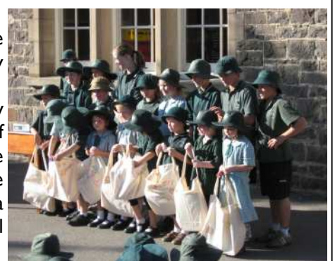
Kyneton Primary School Preps line up with their Home Literacy Bags and their Senior School buddies.

At this year's dinner the Zonta Club presented donations totalling $3,000 to three local groups identified as a direct result of the Project: Strengthening Families "Kyneton Community Playground Project", the Kyneton Community and Learning Centre and the Kyneton Connections directory of services and facilities.