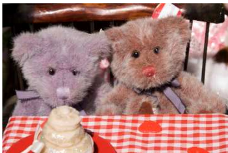
Mr and Mrs T Bear at the Teddy Bears Picnic Kyneton Botanical Gardens April 6