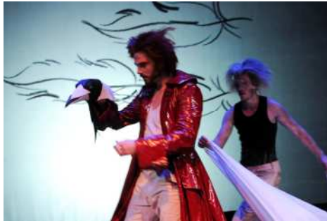
Actors in fantastic costumes in "Fox"

Two fantastic shows for kids are coming to Kyneton Town Hall during the next month. This Friday June 18 at 6pm and Saturday at 2pm will bring "Wombat Stew" the delightful story about the dingo who catches a wombat by a billabong. The dingo decides to make a wombat stew but the wombats friends make sure everything goes terribly wrong for the dingo.