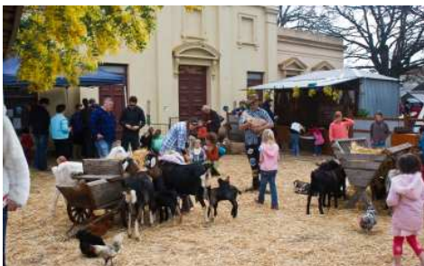
During the Daffodil & Arts Festival in the KMI forecourt—can this continue?

An entire section of the lawn on the rear Northern side of the Reserve has been removed on the grounds that the asphalt that replaces it will be a drop off point for vehicles bringing equipment to the Reserve for the occasional events held in the Reserve. The new draft plan is to go before this month's Council meeting.