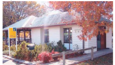
Kyneton Visitor Information Centre High St

It is intended that the process will be transparent and that the consultant will widely canvass community and business opinion from both individuals and organisations and present a detailed assessment and information on the feasibility of all possible options for the delivery of visitor information in Kyneton.