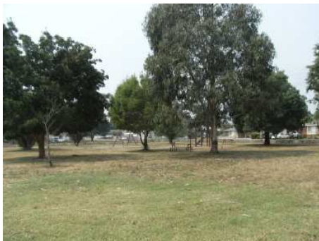
Site at Corner of Victoria & Mair Streets

The request for final in principle support for the project is on the agenda for the March Council meeting.