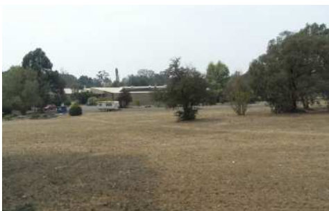
Site for new building at Ray M Begg

Stage Two will see another 30 bed block built where the current Hostel is located. Rooms in the new facility will be bigger than those of the current Hostel and current residents are being consulted about room design features. The architects, Stonehenge group, have recently completed a new aged care facility in Swan Hill.