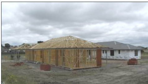
Medical student accommodation under construction in Quinn Crescent, Kyneton