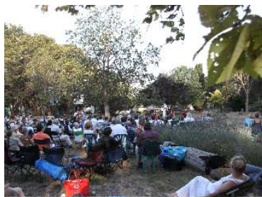
Last year's crowd at Rowanston

Rowanston on the Track Winery is inviting all and sundry to come and revel in William Shakespeare's "The Comedy of Errors" produced by Essential Theatre during their eighth Australian tour of Shakespeare in the Vines.