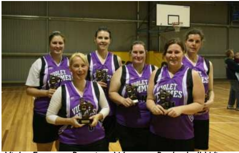
Violet Femmes Premiers Womens Basketball Winter 2009

The Kyneton Sporting Complex has several new programs for the Summer Season: Senior Mixed Indoor Soccer, Senior Men's & Women's Basketball and Senior Mixed Netball. For the juniors, the Kyneton Basketball Association starts their junior season. Womens Basketball is held Monday nights, Mens Basketball Tuesday nights, while Mixed Indoor Soccer and Mixed Netball will be on Wednesdays.