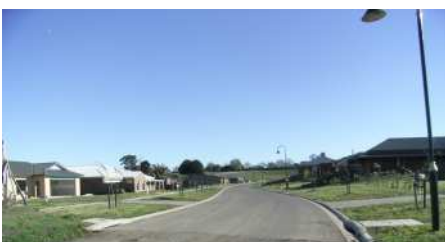
Existing homes in Sanctuary Drive

The proposed explosion of retirement village accommodation and the potential impact on the age profile of the town could have a serious impact on to the ability of this community to sustain itself in the future, yet few Kyneton residents are aware of the proposed developments. Do they have any say in the matter?