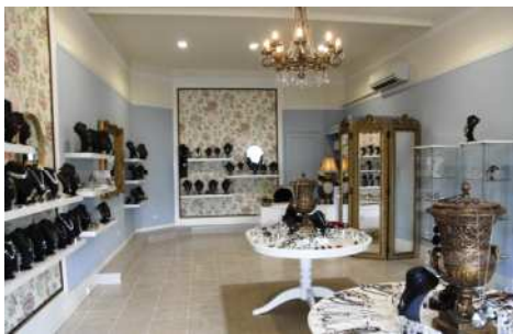
Jewels by Highbury Park