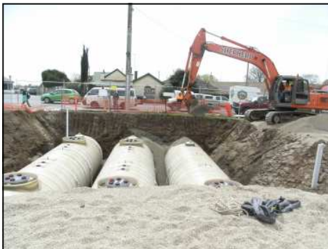
The underground tanks for the new Servo