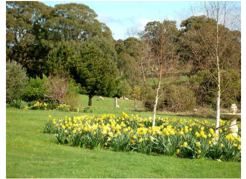
'Sherara', an Open Garden

This year sixteen Gardens will open their gates to visitors with new gardens joining the Open Garden program.