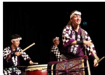
Wadako Rindo Japanese Drummers

Everyone is pleased about the return of the Kyneton Daffodil & Arts Festival, especially the Grand Parade and Fair, celebrating its 50 th year.