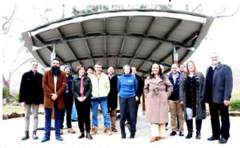
Mary-Anne Thomas MP with Dja Dja Wurrung People, Coliban Water and Council reps

The plants have been selected due to their traditional significance to the Dja Dja Wurrung peoples through their use as food and fibre plants.