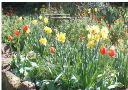
Hourigans' Garden, 36 Tattersall Dr

Four edible gardens will also open - one on Sat Sept 3 and a further 3 on Sunday Sept 4 in Kyneton township. Check the Festival program for locations and open times for all gardens.