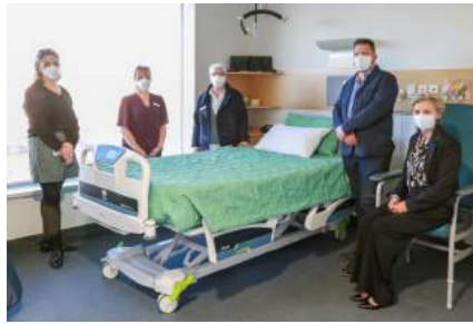
Hospital representatives with Woolling